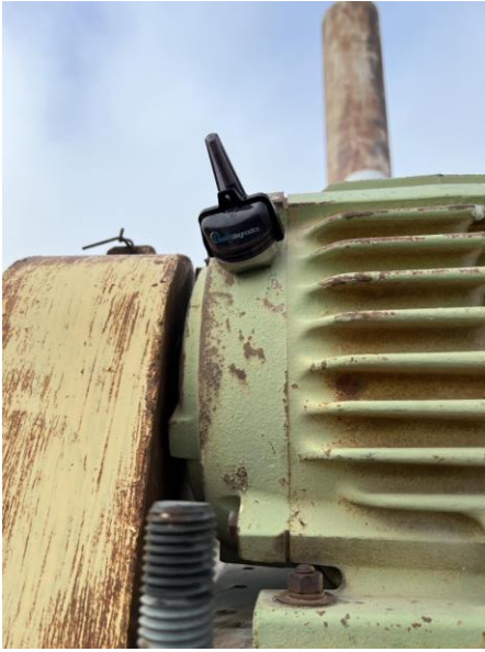
Above: Wireless, magnetic vibration sensor

Relying on preventative maintenance and occasional inspections do not prevent failures on screens and shakers exposed to harsh mine site conditions.